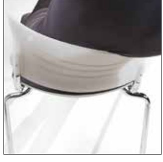
Contoured back provides support and flexes sideways – twisting when you twist. Contoured seat delivers a conforming, comfortable, long-term sit.