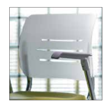
Distinctly different and remarkably versatile, Sitka's translucent poly backs present a unique high-design option.