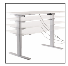
Height Adjustment - from 26" to 52" can be made by dual-motor L-Bases, making them perfect for sit-stand applications.