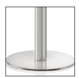
Disk Pedestal Base features a 4" column composed of .04" thick steel with a welded reinforcement.

Both the disk and tapered leg configurations include adjustable thermoplastic glides for additional stability on uneven floors, and high-quality steel materials for durability that will outlast cast iron and closing time.