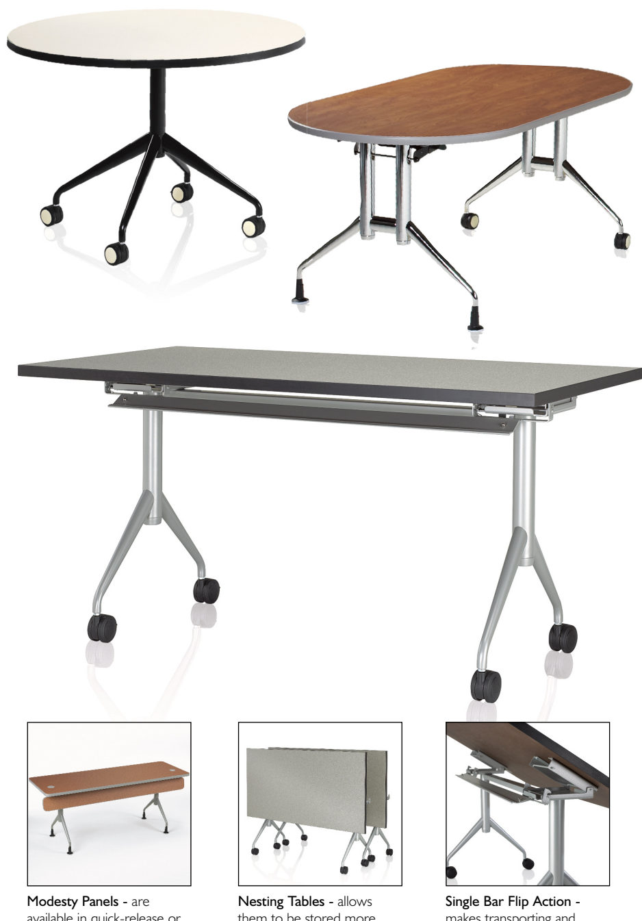
Modesty Panels - are available in quick-release or folding varieties that can be detached or swing out of the way when tables are stored.

With their outstanding functionality and eye-catching design, Develop's T-Bases will make you look at tables like you never have before.