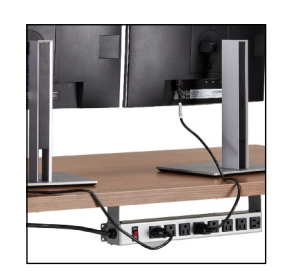
Undermount R8 - allows 8 under-surface electrical receptacles to be powered by a single plug-in connection.