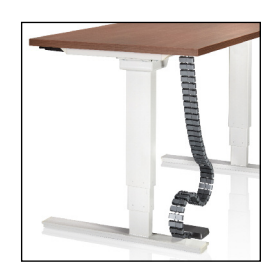
Vertical Cable Management keeps power cords and cables running from the floor to the surface neat and safe during height adjustments.