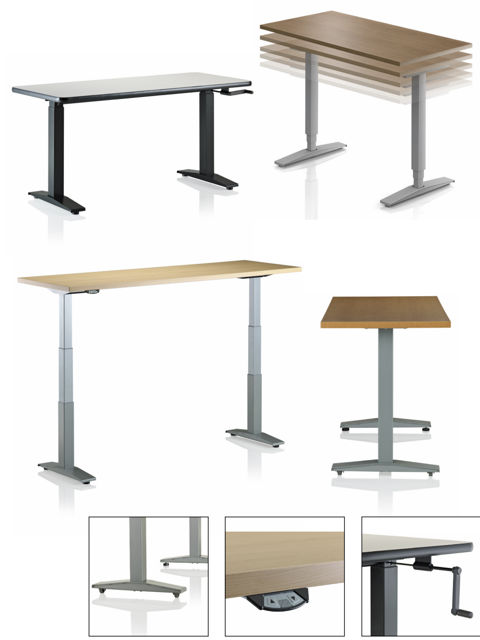
Rolling Base - uses inline casters beneath one end of the table to allow a user to lift the opposite end and steer the base out of the way.

Counter balance bases use a spring and pneumatic cylinder working in concert to make the tabletop seem weightless when the brake is disengaged. They allow users to make adjustments over the 28"-47" range intuitively with very little effort.