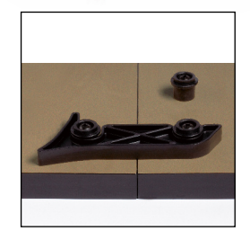
Ganging Device (all tables) allows tables to be mechanically connected without requiring tools and stows securely when not in use.