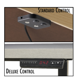
Unobtrusive Controls easily and smoothly adjust tables under load. A deluxe option also displays the height and stores presets.